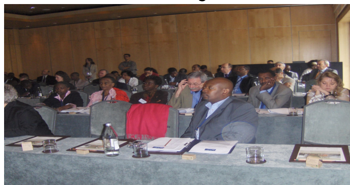
Cape Town Conference

CI participated in the Africa-focused gathering of leaders from all disciplines, hosted by the World Justice Project (WJP), on May 6 and 7, 2009, in Cape Town, South Africa, to develop action plans to strengthen the Rule of Law in communities throughout Africa.