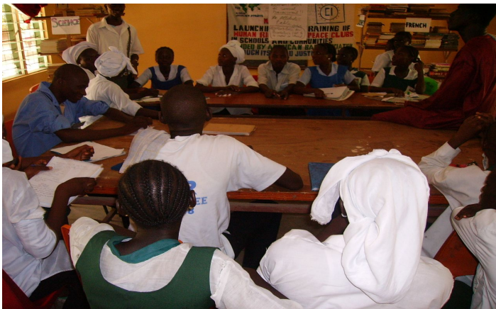
Students from different schools participating in The training at Nasir Ahmadiya Muslim Senior Secondary School in Basse (URR)

CI was proudly acknowledged for successfully implementing the Gender Based Violence and Peace Building Training Program (GBVPBP) in rural and urban communities of The Gambia. In 2009, CI actively collaborated with schools, community groups and with the Ministry of Education and the Department of Community Development of the Republic of The Gambia in the organization of the training activities of the GBVPBP in schools and communities. The objective of the GBVPBP is to empower the students and community folks with redress seeking skills on gender based violence through advocacy, legislation and litigation; and to develop their capacity as to how they can participate in promoting peace as a national obligation. During the Gender Based Violence and Peace Building Training Program it was good indication of the participation from the Government and other development partners.