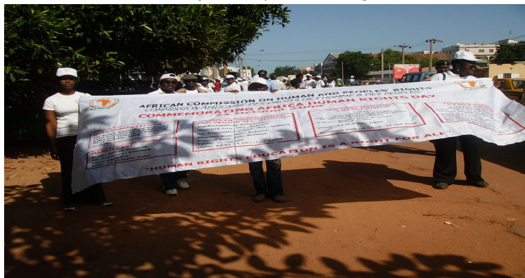
African Human Rights Day celebration 2009

CI was involved in the event of the African Human Rights Day celebration through supporting the organizer - the African Commission on Human and Peoples Rights in marching and wearing printed T-shirts and caps in the event of the 20 th October 2009, in The Gambia. The Director and staff of CI participated in the event. The objective of this involvement is to contribute to the needs and to promote human rights of all Africans especially the marginalized and vulnerable groups.