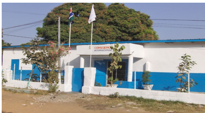
The Secretariat in The Gambia

In 2008, CI opened a Chapter Office in Freetown, following the granting of a certificate with the Freetown City Council of Sierra Leone, in order to better coordinate its activities in Africa and to work in close collaboration with its network of NGOs and partner organizations.