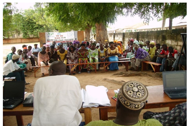
The Chief and the Community Development Officer of Central River Region addressing training participants in Janjanbureh Town